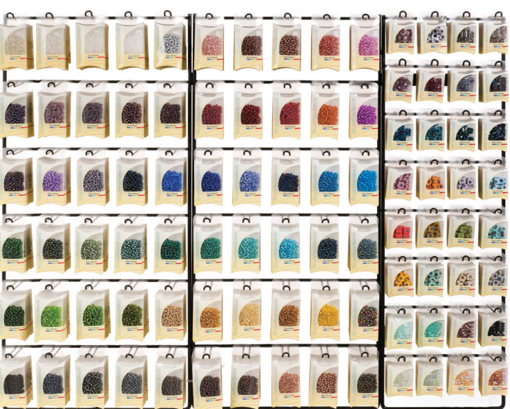
Our POS display panels fit seamlessly into any retail space.

Each collection includes supportive visual marketing material and handy beadwork technique guides which can be passed on to your customers.