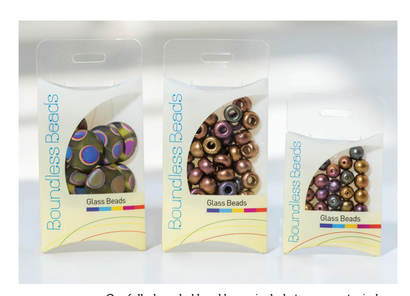
Our fully-branded bead boxes include transparent windows which allow customers to get a real feel for the beads inside.

The contents of each box are determined by quantity or weight depending on the size and style of the element contained, as specified on the label.